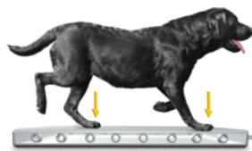
Biomechanical force platform with integrated balance. Speed between 1.7 and 2.1 m/s