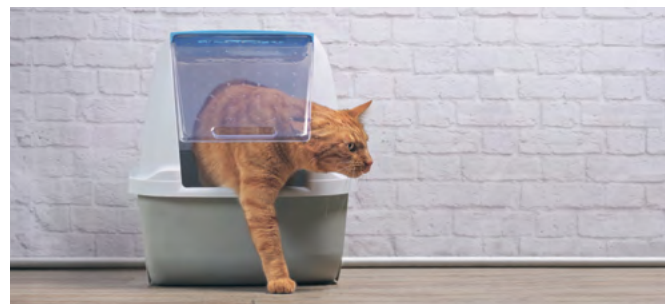
Talking with clients about litter box habits can cue them to observe their cat's behaviour more closely and consult with their veterinarian about any changes.