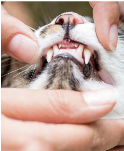
A thorough physical examination, including of mucous membranes, can help veterinarians spot hydration issues and potential problems in feline patients.

I look for skin tenting and sunken eyes and examine the cat's mucous membranes to determine if the cat is severely dehydrated. During the examination, I also ask clients about changes in the size of the cat's litter clumps. If they are drinking more water, are they also increasing their outputs in the litter box or is urine output decreasing? Weight loss also increases my concern about hydration as does diabetes or another polyuric/polydipsic process because these cats may not be able to drink the amount of water they require.