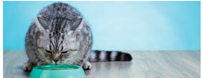
When given access to food and fresh water, most healthy cats stay hydrated; however, aging and health issues can affect the cat's ability to maintain homeostasis of body fluids.

Nevertheless, two strategies can help increase fluid intake in cats.